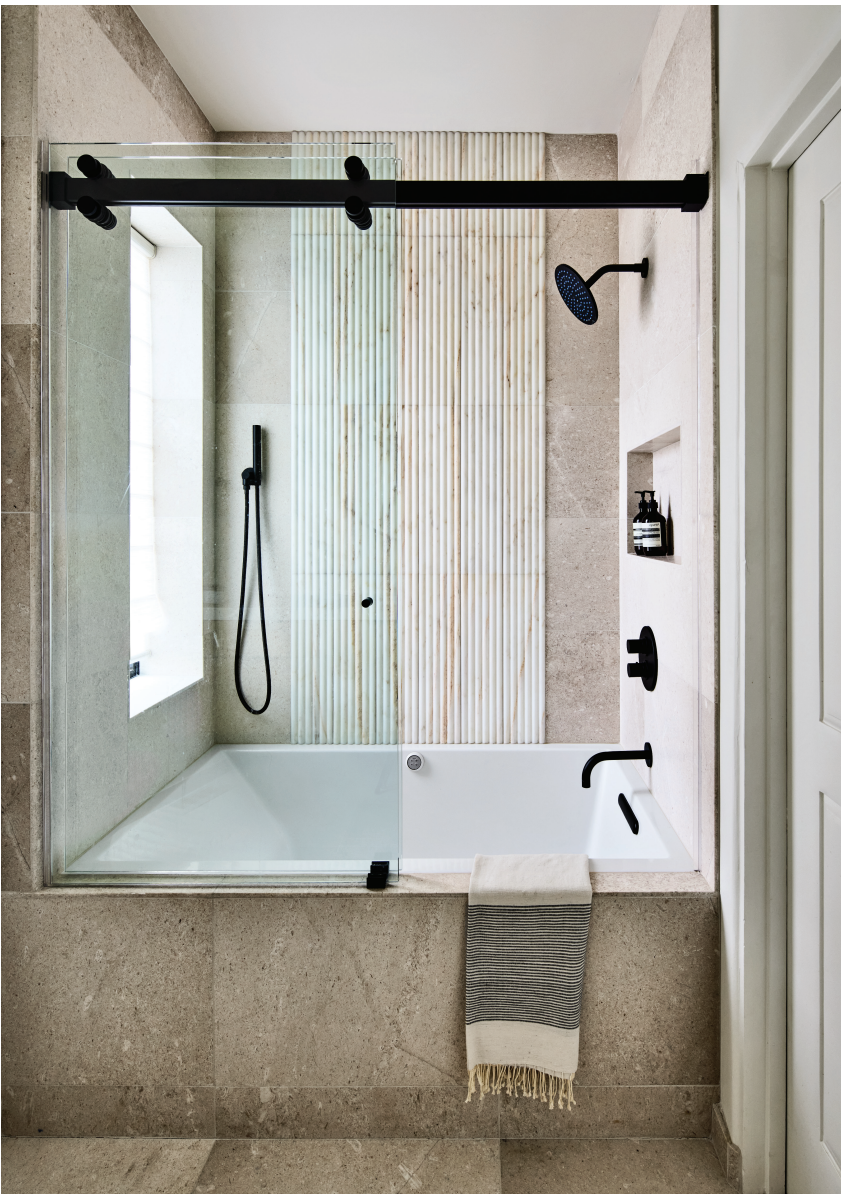
Above: The Kohler tub provides a spa-like experience in the secondary bath. Crema Vossione limestone from Arizona Tile surrounds the tub, accented in fluted honed Calacatta Amber marble from Marble Systems and matte black Watermark Designs fixtures from Reece.