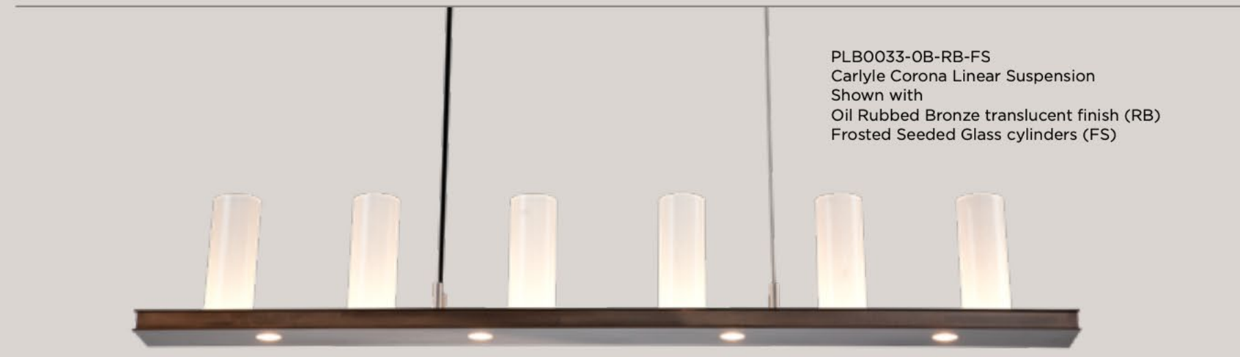
PLB0033-0B-RB-FS Carlyle Corona Linear Suspension Shown with Oil Rubbed Bronze translucent finish (RB) Frosted Seeded Glass cylinders (FS)

Most fixtures offer a selection of domestically hand-textured art glass shades and lens materials. Choose from eight environmentally compliant finishes, including four luxurious opaque finishes and four translucent finishes that rival plated alternatives in visual appeal.