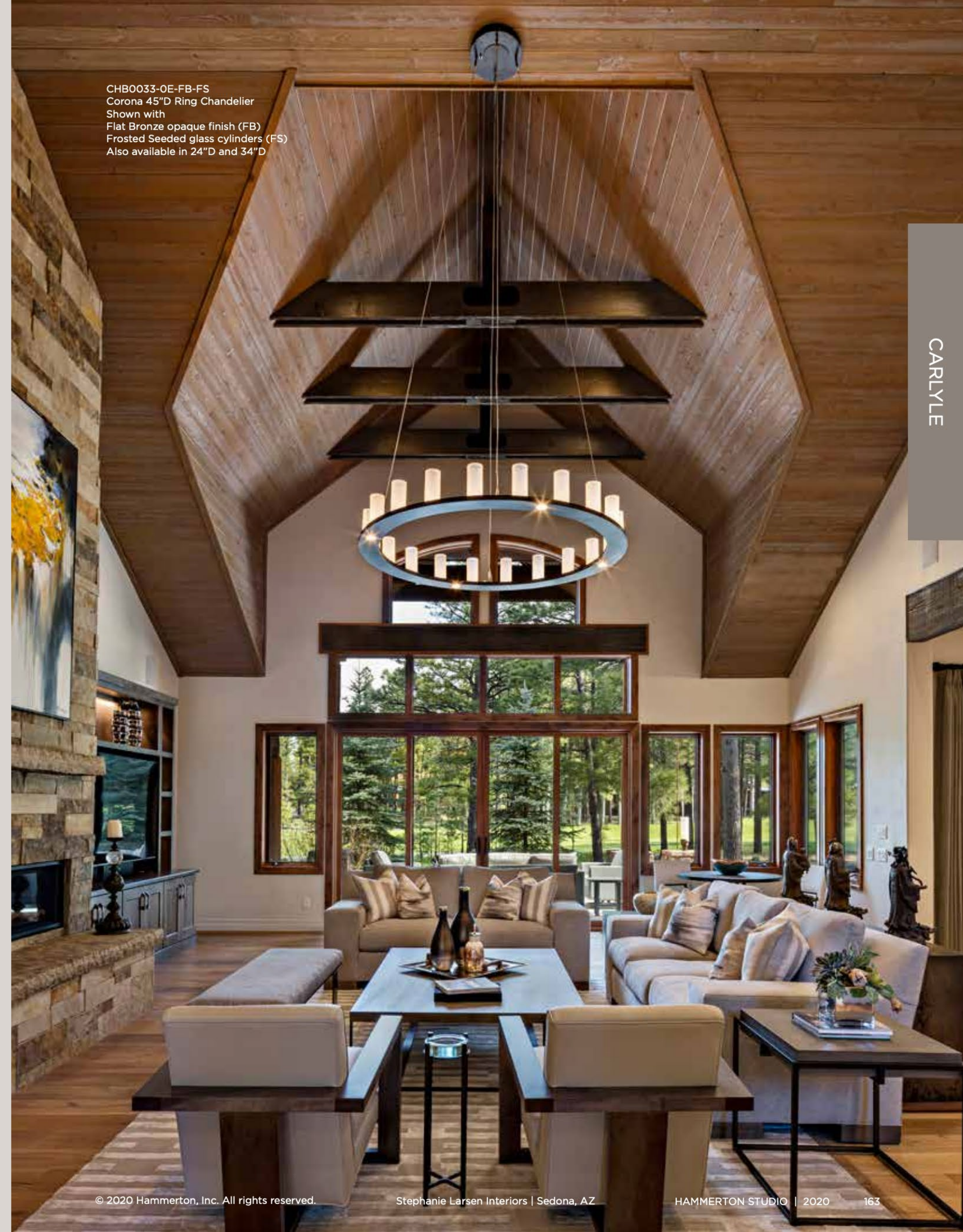
CHB0033-0E-FB-FS Corona 45"D Ring Chandelier Shown with Flat Bronze opaque finish (FB) Frosted Seeded glass cylinders (FS) Also available in 24"D and 34"D

Integrated LED with 93+ CRI and 2,700 CCT is standard for all Carlyle Corona products. Includes matching round or rectangular canopy and adjustable cable suspension. For complete specification details and drawings on all products, visit hammertonstudio.com . Measurements are listed in inches.